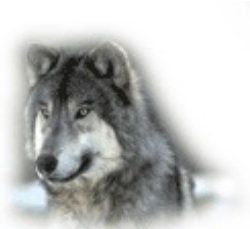
The Wolf - Humility